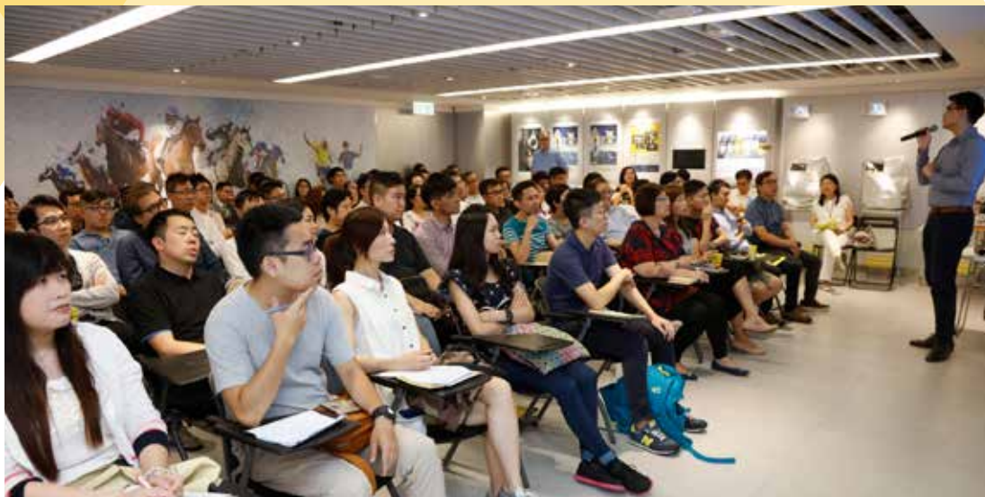
Professional counselor shared experience on problem gambling cases during the responsible gambling training organized by the Club. 馬會邀請專業輔導員向全體前線員工提供有節制博彩企業培訓，分享相關個案經驗。