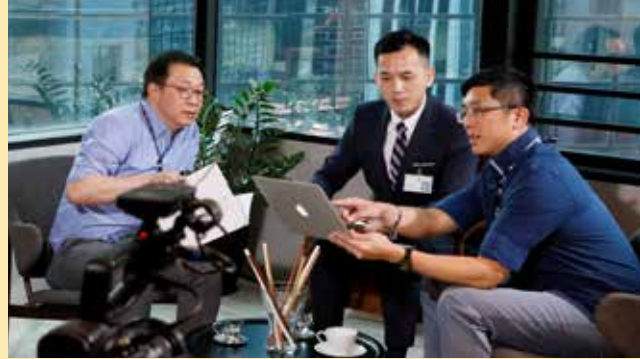
Representatives from Hong Kong Police Force reminded the public on the consequences of illegal gambling during responsible gambling info-segment production.