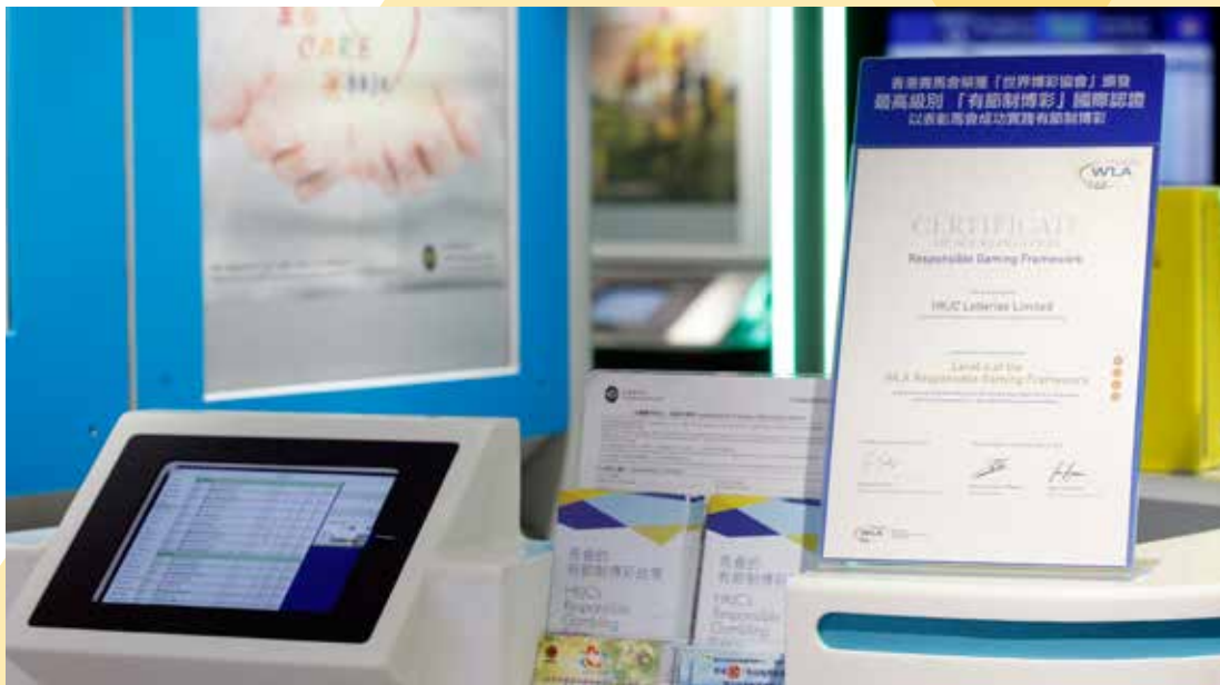
In 2015, HKJC was again awarded the highest recognition (Level 4) of World Lottery Association. 2015年馬會再次獲世界博彩協會頒發「有節制博彩」最高級別（第四級別）認證。